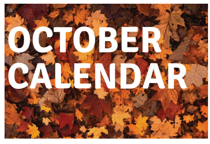
Below are a few highlighted events in October. More at fpcfw.org/calendar.

For details or to sign up: FPCFW.ORG/CHILI