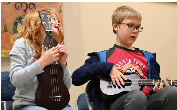
Above: WHAM Ukulele Class had a wonderful time learning and making music during February. Below: The Boomers enjoyed an evening of fellowship and dinner on January 16 and helped pack over 200 sack lunches for day laborers.